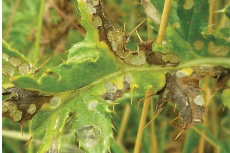
Typical feeding damage by the green thistle beetle.

CONTACT: Jesse Bythell ( jesse@biosis.co.nz ) and Hugh Gourlay ( gourlayh@landcareresearch.co.nz )