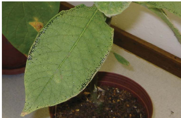
Typical lace bug frass along leaf margins.

CONTACT: Lynley Hayes ( hayesl@landcareresearch.co.nz )