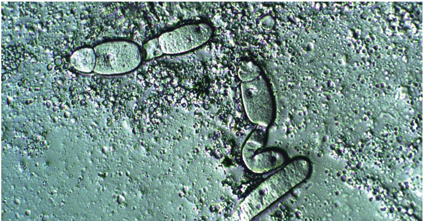
Mature gregarine gut parasites from the tradescantia leaf beetle (×100 magnification).

As well as three other highly promising beetle species, we have identified a sawfly, gall midge, moth, and several pathogens in Brazil which show potential too. Colonies of two of these beetles ( Neolema abbreviata and Lema basicostata ) are in containment at Lincoln and host-range testing is underway. These beetles are being checked regularly for gut parasites and none have been detected so far in Lema basicostata , but low levels of another gregarine parasite have been detected in Neolema abbreviata . We are following the methods we established for the leaf beetle to achieve a clean colony of Neolema abbreviata . We hope to be able to prepare an application to ERMA to release one or both beetle species by March 2010. These beetles should complement the leaf beetle extremely well by damaging the stems and tips.