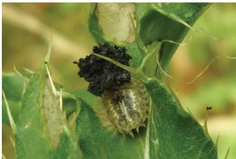
Green thistle beetle larva on a leaf.