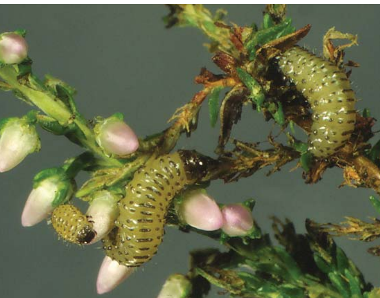
Heather beetle larvae.