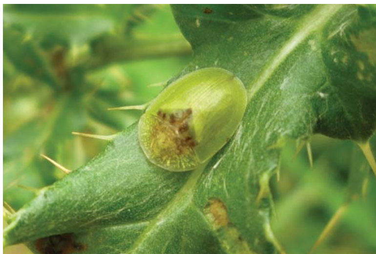
A more yellowy adult green thistle beetle.