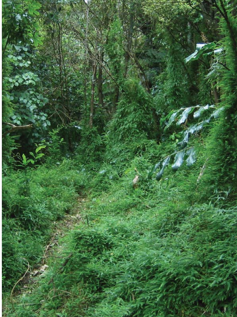
Climbing asparagus smothering native bush in the Waitakere Ranges.

The one bright spot offering some hope was that both fruit production and seed viability are low in South Africa. Although most of the problems we have with the weed in New Zealand are due to its vegetative growth, the fruits are eaten by birds, which is helping the plant to spread to new areas, so reducing reproductive output would be useful. Unfortunately the organisms responsible for poor fruiting and seed viability in the native range are not suitable to introduce to New Zealand. The pathogens isolated were bacteria, yeasts and common endophytes with no prospects for biocontrol. "A wasp ( Eurytoma sp.), which feeds on the seeds, may need access to a range of Asparagus hosts for high levels of attack to occur on climbing asparagus," said Carien. Also one of these alternative hosts is cultivated asparagus and, since all commercial crops of this popular vegetable in New Zealand are produced from crowns grown from seed, any application to release this wasp would be vigorously opposed by the industry.