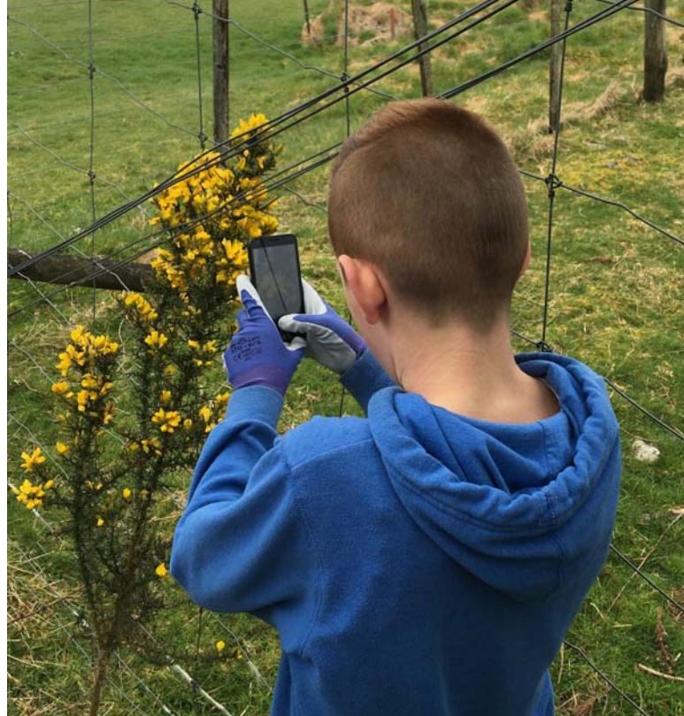
Whataroa student using phone app to identify gorse.

On the second day at Lincoln, Hugh showed them around the containment facility, where the insects used for biocontrol are studied and reared. One lucky student was even given a package of beetles to take back to his school to release on the tradescantia that had been found growing under a nearby bridge! Students