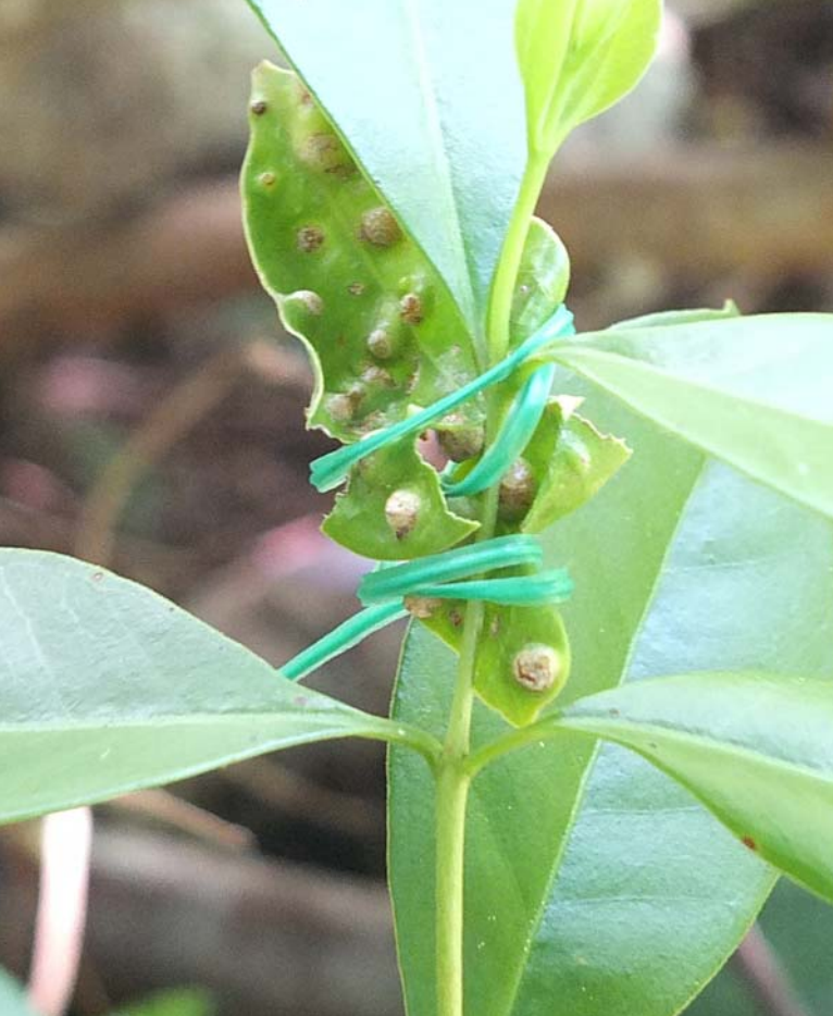
The technique used for releasing the strawberry guava scale.