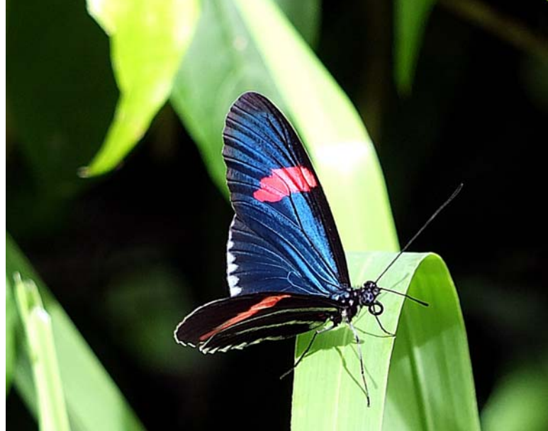
Red postman butterfly.