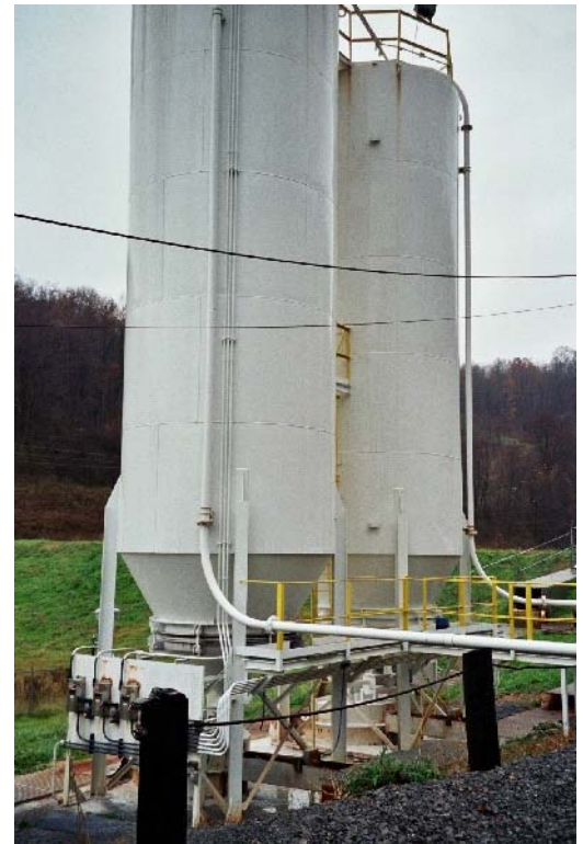
Figure 1: Active treatment system.

Treatment can be accomplished by either active or passive treatment systems (Figures 1 and 2).