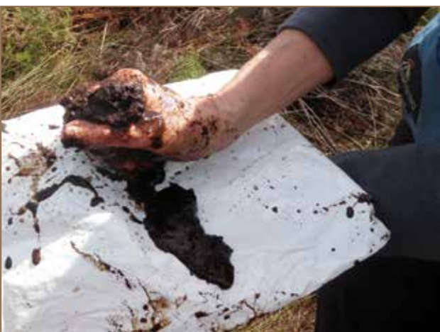
von Post 8: very strongly decomposed; about two-thirds of peat escapes like toothpaste between fingers. Torehape peat mine, degraded margin. Waikato.