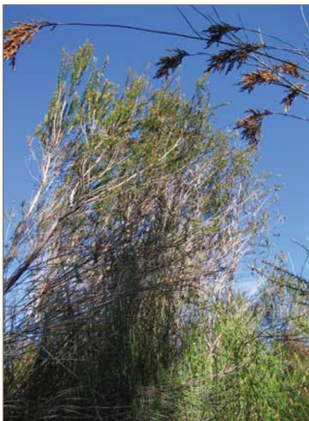
Moanatuatua Scientific Reserve (120 ha) is a rain-fed bog remnant situated close to Hamilton (Waikato): The original bog covered an estimated 7500 ha.

Which of the highly ranked factors might feasibly be changed to return the system closer to its natural state?