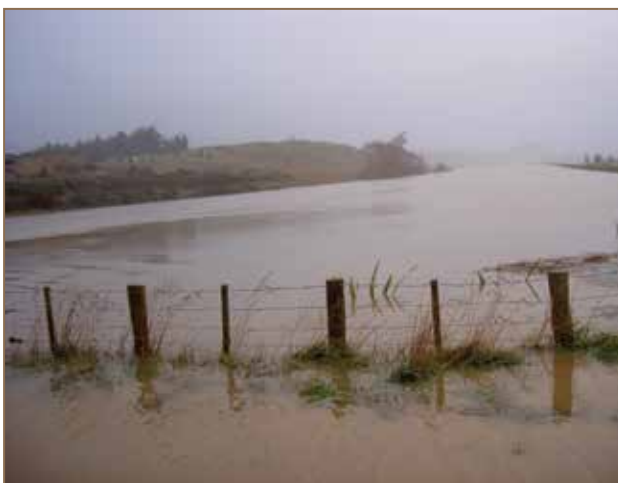
The Taieri River (Otago) is a highly modified system – with many wetland areas in the catchment drained, severe flooding can result after heavy rainfall.

Natural wetlands require water tables that fluctuate seasonally and in response to pulses of water inputs (e.g., from rainfall, tides, flooding rivers) – but not too much fluctuation, or too little. For example, artificial water control structures often result in unnaturally stable or high water tables. On the other hand, extreme water table lowering caused by artificial drainage or drought will challenge the survival of some wetland plants and animals, and may allow dryland weeds to invade.