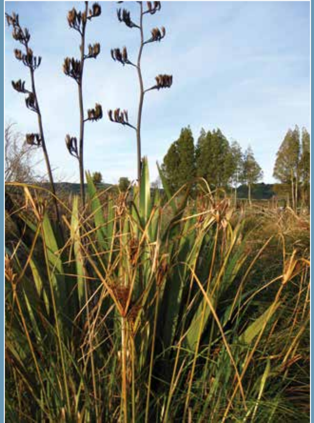
Native plant regeneration inside the wetland view from the boardwalk.