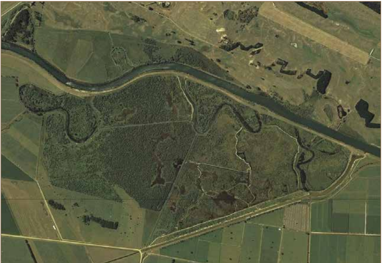
The Lower Kaituna Wildlife Management Reserve (BoP) is bordered by stopbanks and drained farm land, creating a “perched” wetland with water management problems.