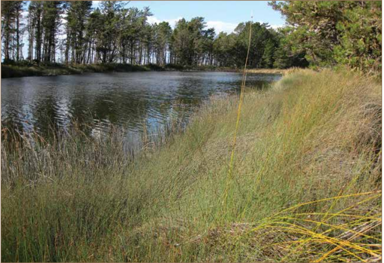
The vegetation of this dune lake on Matakana Island reflects changes in salinity as the narrow barrier separating the wetland from the sea is periodically breached.