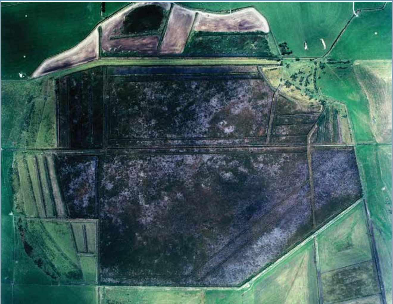
Aerial view of the Dunearn peat bog remnant clearly showing the network of deep drains .