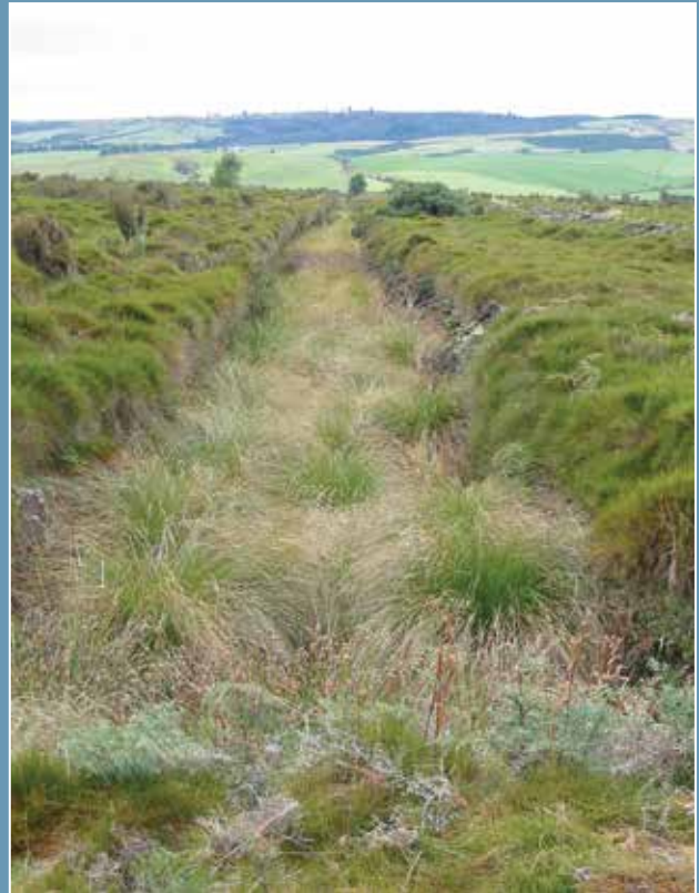
With drainage species tolerant of drier conditions were able to colonise areas formerly dominated by wire rush ( Empodisma minus ).

REF: Dunearn peat bog: The restoration of a wire rush peat bog through the raising of its water table. Dept of Conservation internal report DOCDM-367540