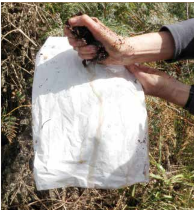
von Post 2: almost decomposed; plant structure distinct, yields only clear water coloured light brown. Torehape peat mine, intact bog. Waikato.

The amount of decomposition is gauged in the field by assessing the distinctness of the structure of plant remains and colour, determined by squeezing a handful of wet peat. The following standards (Table 1) are based on those of von Post (Clymo 1983).