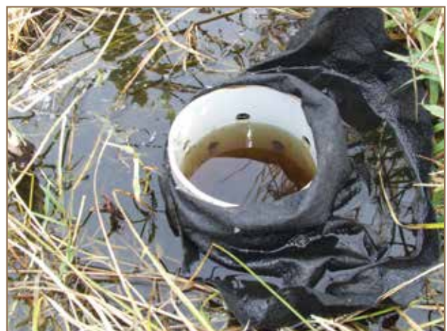
The textile is folded over the top of the well to prevent the build up of algae inside.

Installing a dipwell is an inexpensive way of measuring the water table elevation. A dipwell usually consists of a plastic tube 30–60 mm in diameter with small holes or 1–2 mm slots cut along its length, sealed at the base with an end-cap and wrapped in a geotextile such as shade cloth, to prevent fine material clogging the tube. Because wetland soils are usually very soft, dipwells can often be pushed in by hand, otherwise a hand auger may be used. Dipwells need to extend deep enough to intersect with the water table in very dry spells. Piezometers have a similar construction except that the section with holes or slots is at a specific depth, and they are mainly used in groundwater studies to determine the direction of vertical water movement.