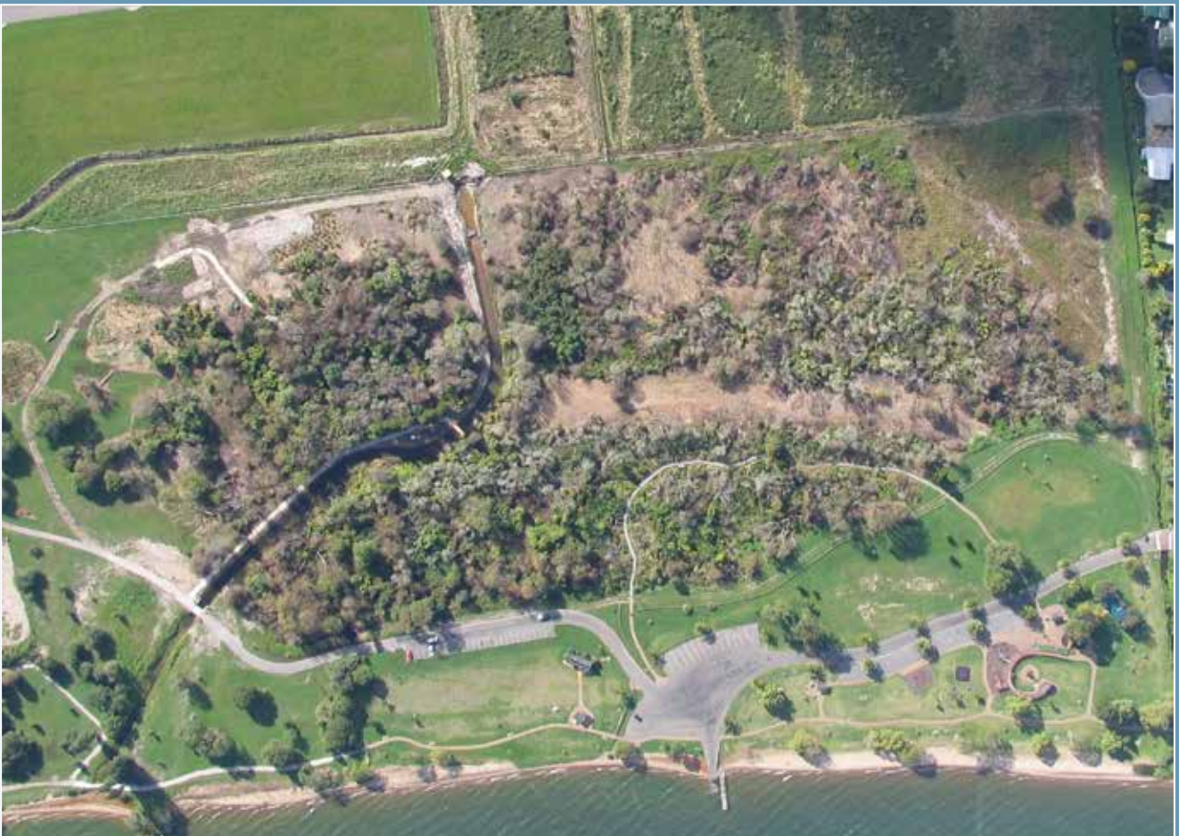
Hannah's Bay/Otaiura wetland is situated on the shores of Lake Rotorua. Photo taken in 2006 showing stormwater channel.