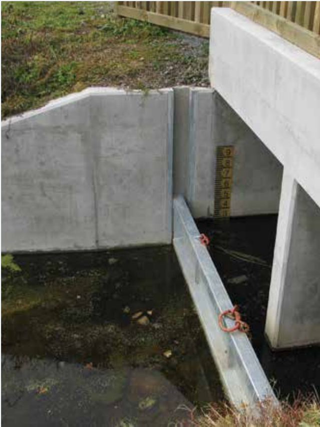
Culvert with removable concrete inserts to enable further hydrological manipulation when required.