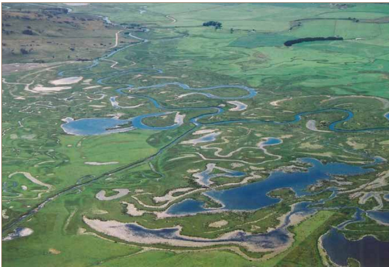
This intricate scroll plain in the upper Taieri (Otago) is the result of a river meandering across an area with a very low gradient.

availability of water or water convergence. If these hydrological conditions are provided a wetland will form, although it might not be the type of wetland you are setting out to establish. It follows that wetland restoration is only likely to be successful in locations where water flows already converge, unless you're prepared to carry out major engineering works. Any planned modifications to water flows such as blocking drains should aim to reinstate the natural degree of water convergence by slowing water flows rather than creating an artificially imposed hydrological regime, such as damming streams.