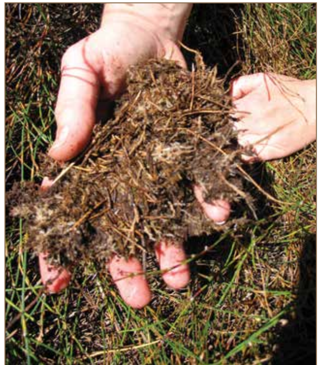
Wire rush ( Empodisma minus ) with its dense mass of upward growing roots is a key peat forming species. Moanatuatua Scientific Reserve, Waikato.

A further consideration for restoration is the degree to which the peat is decomposed. Using a simple “squeeze test” a handful of undecomposed peat will show obvious plant structure and yield clear water. At the other end of the scale, well-decomposed peat will not show any plant structure and will ooze out between the fingers like toothpaste. The level of decomposition is closely linked to nutrient levels, hence to vegetation type. As undecomposed peat is lower in nutrients than well-decomposed peat, the plants selected for revegetation will need to be considered based on how decomposed the peat is. The von Post Index (included in the monitoring section of this chapter) is widely used to determine the level of peat decomposition.