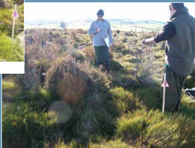
Plot 8 remeasured in 2009.

From 2004 wire rush coverage climbed 27% to an average of 68% cover in 2008, clearly showing that the raising of the water table was resulting in a rapid increase in wire rush cover. Furthermore, those plots closer to the drains responded more than those furthest away (c. 24% vs c. 7% increase) showing that the low water table around drains had further impacted on total wire rush cover. These results are preliminary and better statistical analyses are needed to strengthen findings and model future trajectories.