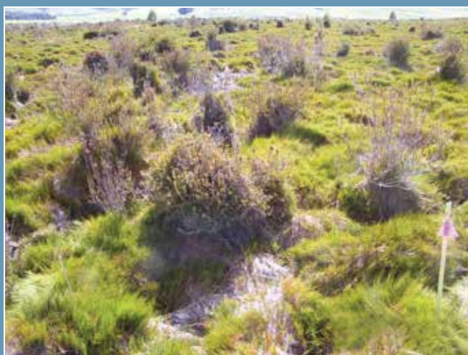
Plot 8 in 2003.

The 60-ha Dunearn peat bog in western Southland is an excellent example of a raised peat bog system. The site was bought by the Department of Conservation (DOC) in 2003 through the Nature Heritage Fund. To develop the surrounding land for agriculture, deep drains c. 2.5 m wide and 2 m deep were dug through the wetland remnant and around the periphery. Key indicators for the declining health of the wetland took the form of peat shrinkage and the dieback of wire rush – a key peat-forming species. Hydrological restoration took the form of blocking the drains with sods of peat at 100-m intervals in order to raise water levels to prevent further peat degradation and encourage wetland plant recovery.