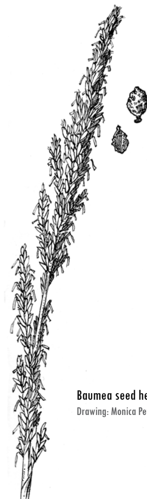
Baumea seed head.