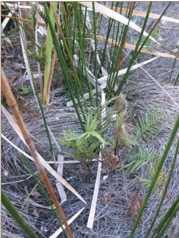
The rare fern, Cyclosorus interruptus. Matakana Island, Bay of Plenty.

Management agreements for conservation purposes are mostly entered into between landowners and a government agency, though in some circumstances they may be developed through other organisations such as the Waiau Fisheries and Wildlife Habitat Enhancement Trust. A significant advantage of management agreements is their flexibility – they can be negotiated to suit the nature of, and any special circumstances associated with, the site. They can also be negotiated around current land uses and landowner needs. The success of a management agreement will ultimately lie in how clearly the rights and obligations of each of the parties in the agreement are laid out, for example, who will be responsible for on-going site maintenance.