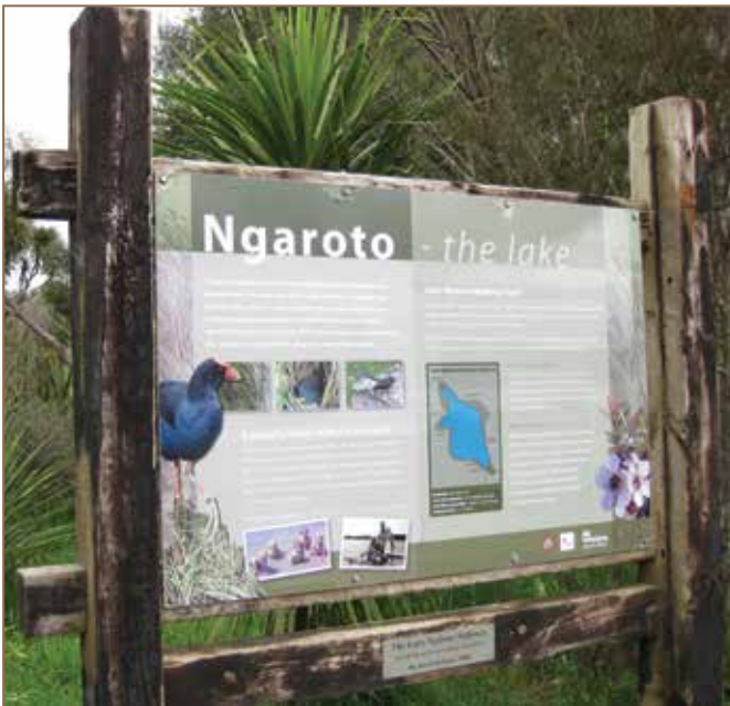
Lake Ngaroto (Waikato) is a recreation reserve administered by Waipa District Council.