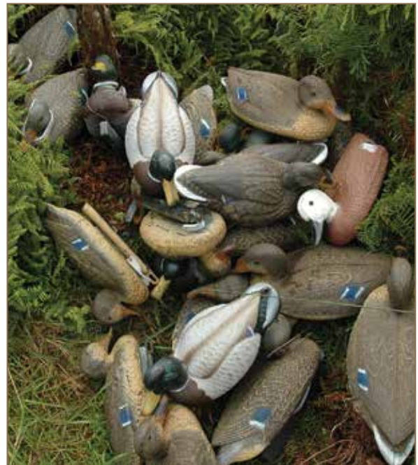
Duck decoys.

One of the many reasons a landowner may choose to protect the wetland through formal means could be to ensure continued hunting opportunities. Lake Serpentine, Waikato.