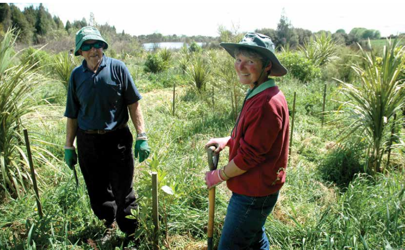
Community planting at Lake Serpentine, Waikato.

Access across privately owned land to the wetland restoration usually relies on the goodwill of landowners. If the wetland restoration site shares a boundary with privately owned land or is located within the boundaries of privately owned land, then an easement may be negotiated with the landowner. This formal agreement will help avoid any future access issues through, e.g., changes in land ownership. Survey and legal costs, however, can be quite significant even if the landowner grants an easement without requiring payment for the grant. Estimates of costs from professional advisers early in the process are highly recommended. Check with the district council first to find out if any easements or unformed 'paper roads' already exist.