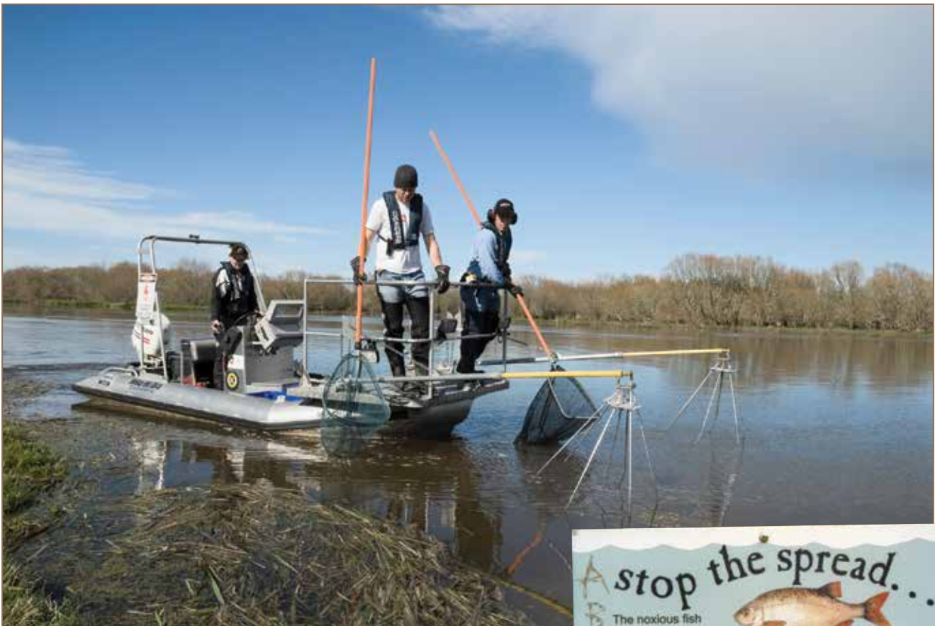
University of Waikato researchers electrofishing in Whangamarino.