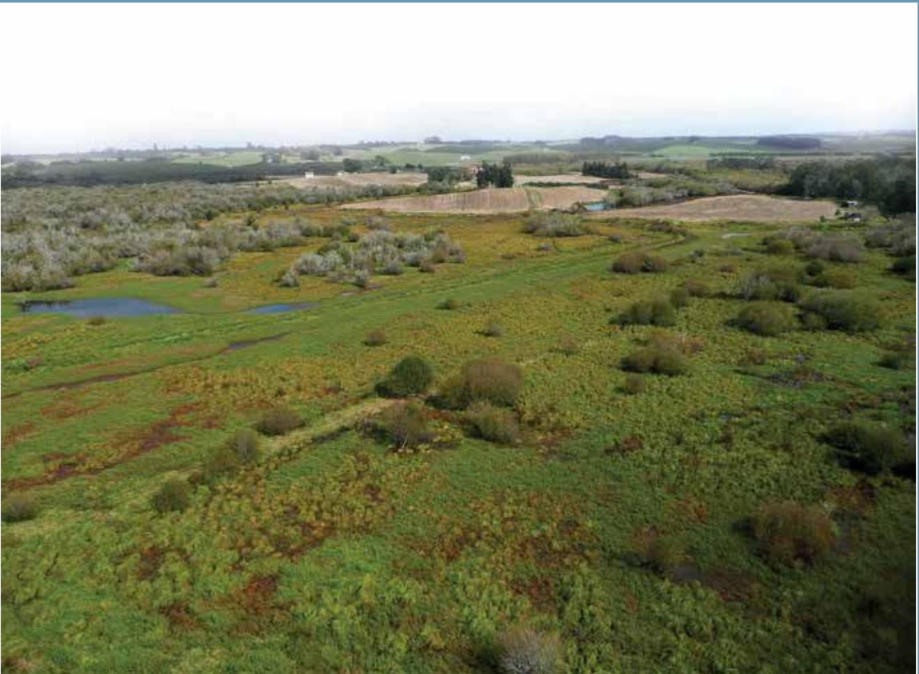
Whangamarino (Waikato) is an extensive mosaic of different wetland types and is administered by the Department of Conservation.