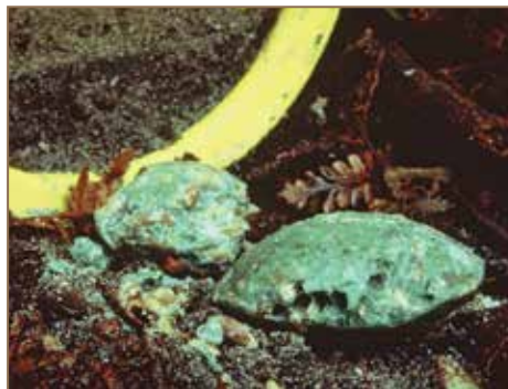
Talon rat bait with chew marks. Te Anau.

Researching historical records and locating similar wetlands (outlined in Chapter 4 – Site interpretation 1) may yield important information on the types and population numbers of animals – both introduced and native. Knowledge of the species that were once likely to be present in the wetland will help guide restoration goals.