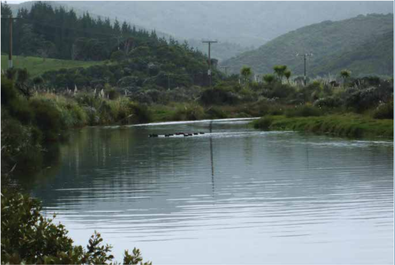
The 42 ha Waikawau Bay wetland on the remote north eastern tip of the Coromandel Peninsula comprises an almost unbroken sequence from saline to fresh water wetland types.