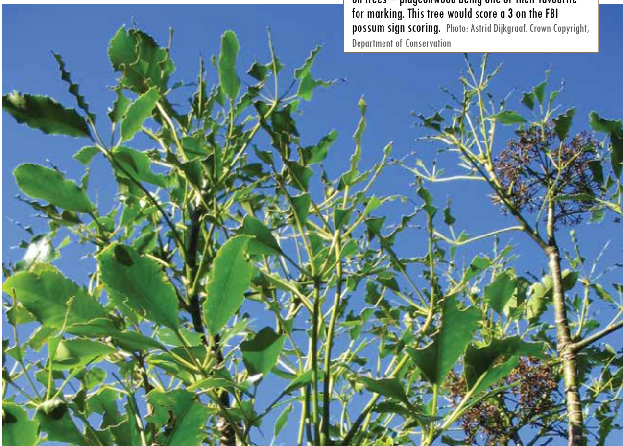
Take care not to misidentify the browser. Damage to this five finger was most likely caused by insects, not possums. Waihi beach, Waikato.