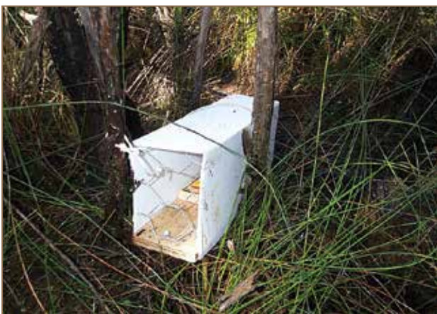
Victor professional rat trap with wire mesh to prevent accidental damage to ground foraging native birds.

Costs for, e.g., equipment, training, poison, baits, and labour) should be included along with an overall cost. This information is also needed when applying for funding to carry out pest control activities.