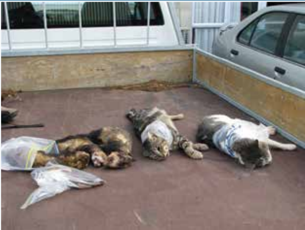
Two cats, three ferrets and a stoat (a single day's haul from the wetland), would likely put a dent in the native bird population.