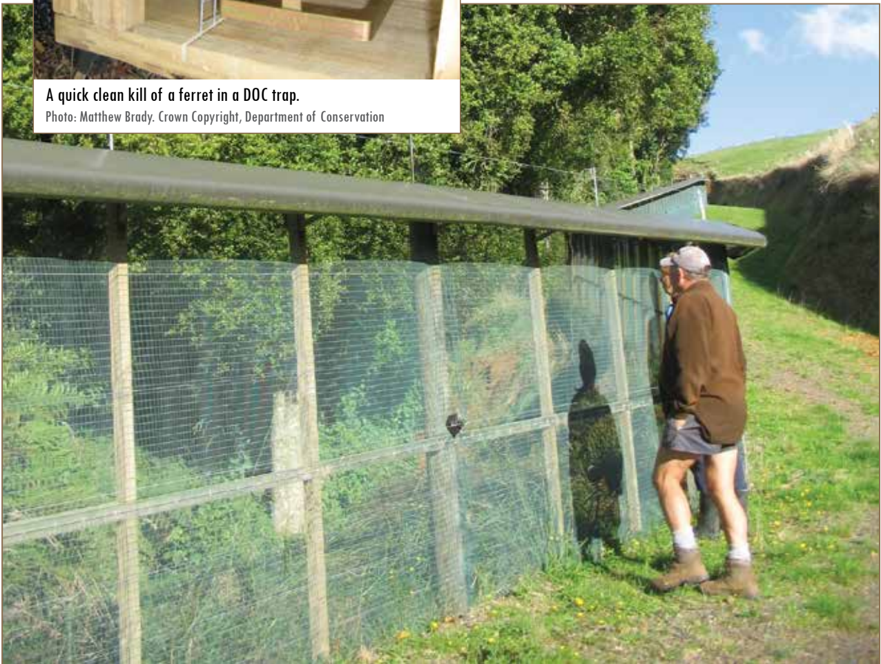
A section of the 42-km pest-proof fence at the Maungatautari Ecological Island, Waikato.