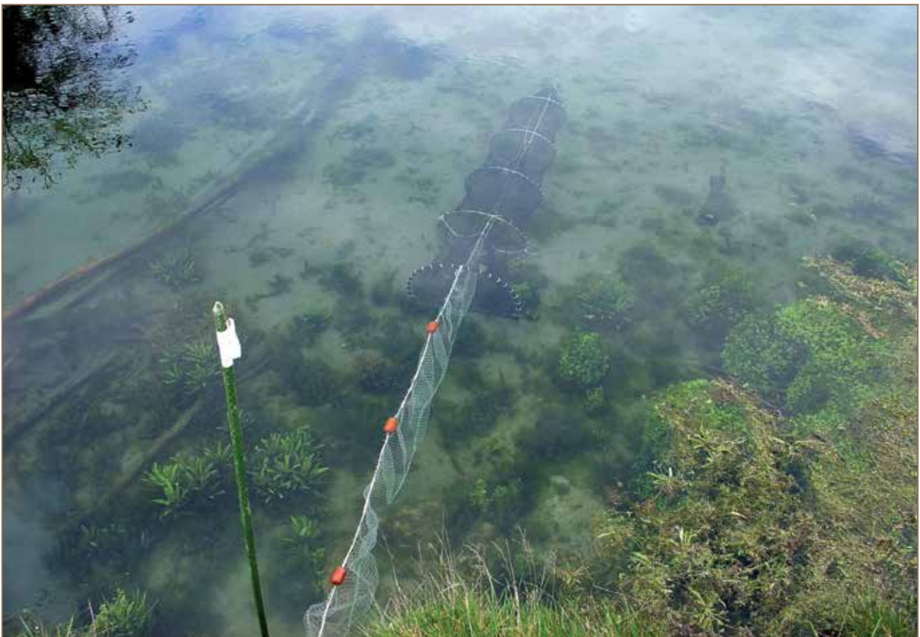
Fyke net set up underwater for freshwater fish surveying. Canterbury.

Mark the spot with flagging tape so that the traps can easily be found the next morning. Leave an air gap at the top of the traps and nets because water in wetlands can become de-oxygenated overnight. Care should also be taken to avoid setting gear during floods when water levels can drop and expose fish. If pest fish are caught, contact DOC as this information could help the Department and other interested parties keep track of the spread of these species.