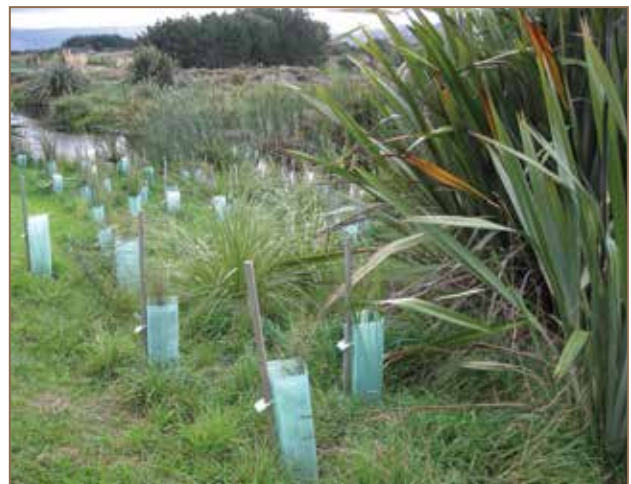
Hare control using sturdy plastic frames that wrap around plant stakes. Te Hapua, Wellington.

– www.bioprotection.org.nz/system/files/Greening+Waipara+Newsletter+No+1.pdf