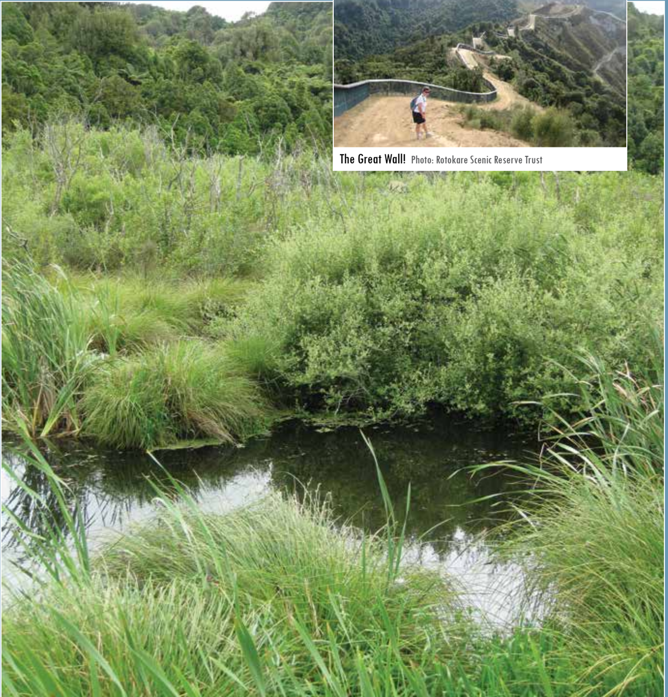
The Great Wall!

The Rotokare Sanctuary Project is led by a community-based charitable trust, Rotokare Scenic Reserve Trust (est. 2004).