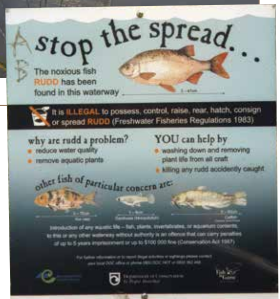
Sign to help raise awareness and stop the spread of pest fish. Lake Janet, Canterbury.