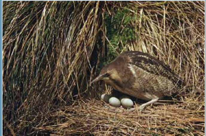
The elusive Australasian bittern.