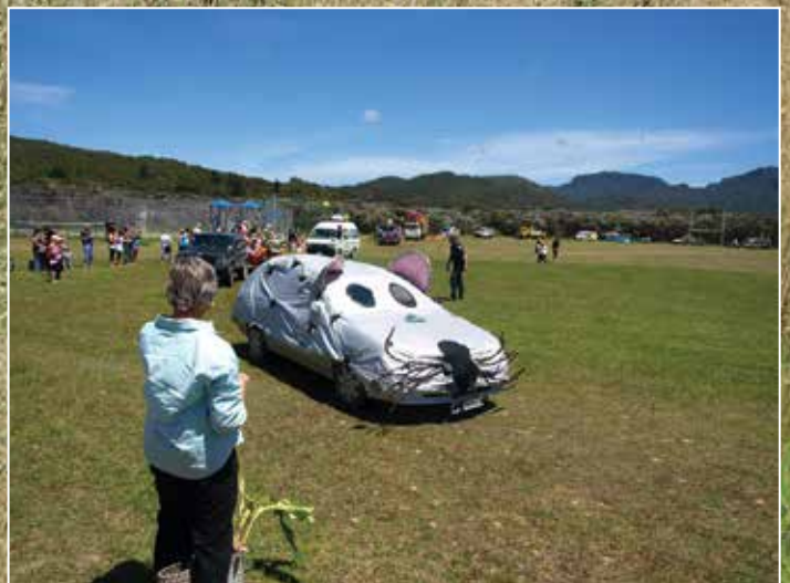
The Great Barrier Island Trust found a novel way to raise awareness of the damage rats do to native biota: a Christmas float dressed as a rodent!