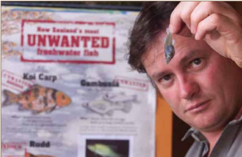
The ability of Gambusia/mosquito fish to control mosquitoes has been exaggerated. They are highly aggressive, attacking fish much larger than themselves.