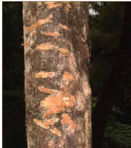
Possums mark their territory by leaving chew marks on trees – pidgeonwood being one of their favourite for marking. This tree would score a 3 on the FBI possum sign scoring.

Note that this method does not provide answers to longer term questions such as recruitment rates of palatable species.