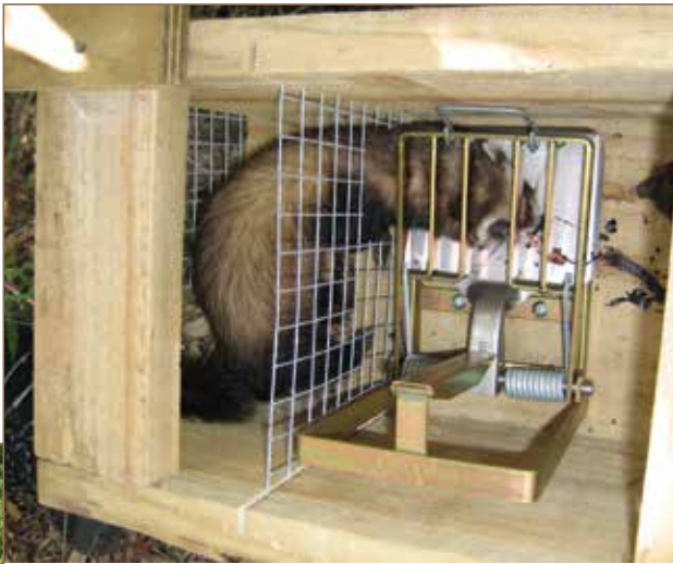
A quick clean kill of a ferret in a DOC trap.