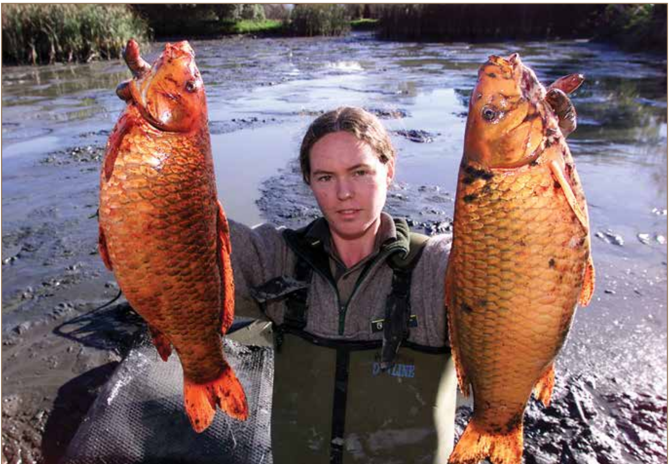
Many people are unaware of the damage pest fish such as koi carp do to our waterways.