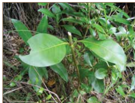
Hare damae on karamu. Hawke's Bay.