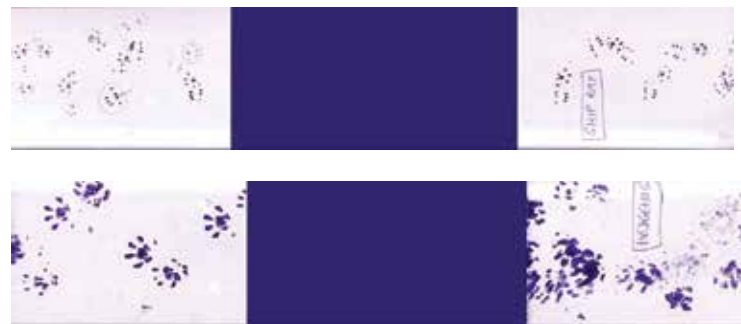
Tracking tunnels prints showing ship rat (top) and hedgehog. Solid blocks of colour are the ink pads.

Tracking tunnels are used widely to gain an index of the density of introduced small mammals (e.g., possums, mustelids, rodents, and hedgehogs) and to determine whether wetland predator control has been successful. In recent years, use of such tunnels has largely replaced the use of kill-trapping as the main rodent density index. Tracking tunnels rely on ink-pads and paper to record the tracks of target species (e.g., rats). Their abundance is calculated by extrapolation. Inked papers are laid out within a plastic tunnel and baited with a small amount of peanut butter or rabbit meat. Tunnels are pegged to the ground using wire. Footprint guides are available – see the Useful website section for links.