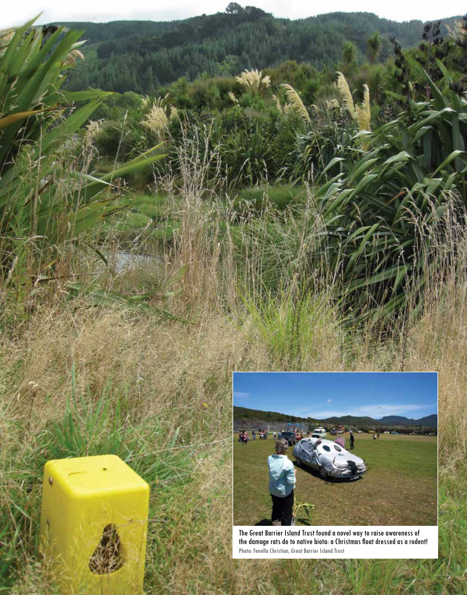
Fenn trap on the edge of a wetland. Battle Hill Farm Park, Wellington.