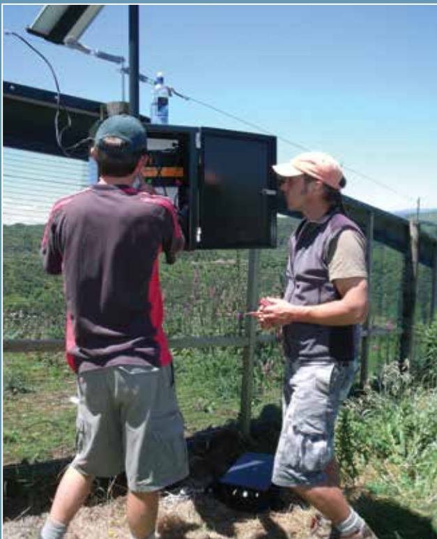
Fixing fence surveillance equipment.

The Rotokare Scenic Reserve Trust ( www.rotokare.org.nz ) quickly recognised that ongoing control of pest species, i.e. Norway and ship rats, mice, ferrets, stoats, weasels, hedgehogs, rabbits, hares, feral cats, possums, and goats, within the previously unfenced reserve was financially and operationally unsustainable. Breeding of surviving pests continued, as did reinvasion from outside the reserve. A new objective was established: create a pest-free sanctuary through construction of a pest-proof fence and eradication of all pests inside the fence.