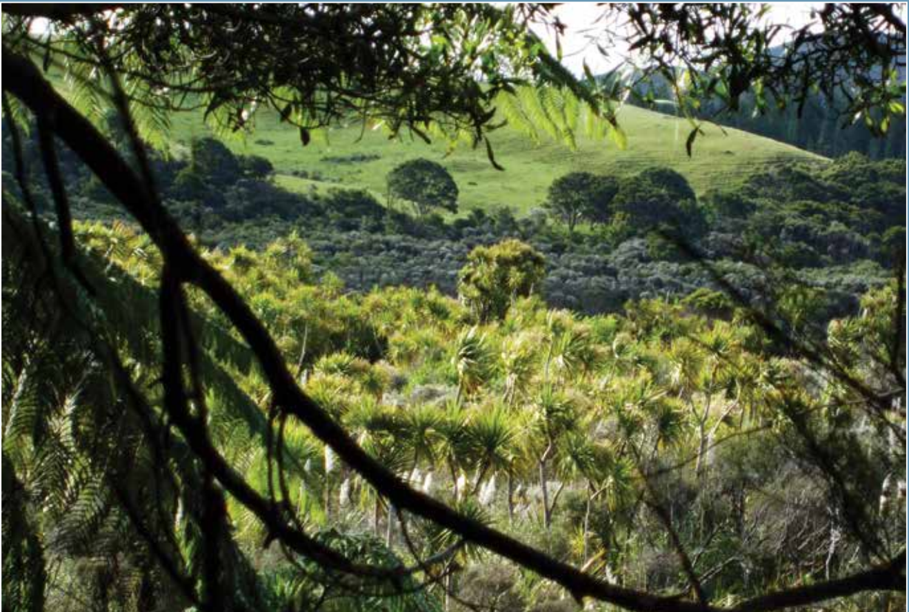
Minimising disturbance to the wetland means keeping to established tracks for pest control and other activities such as monitoring.