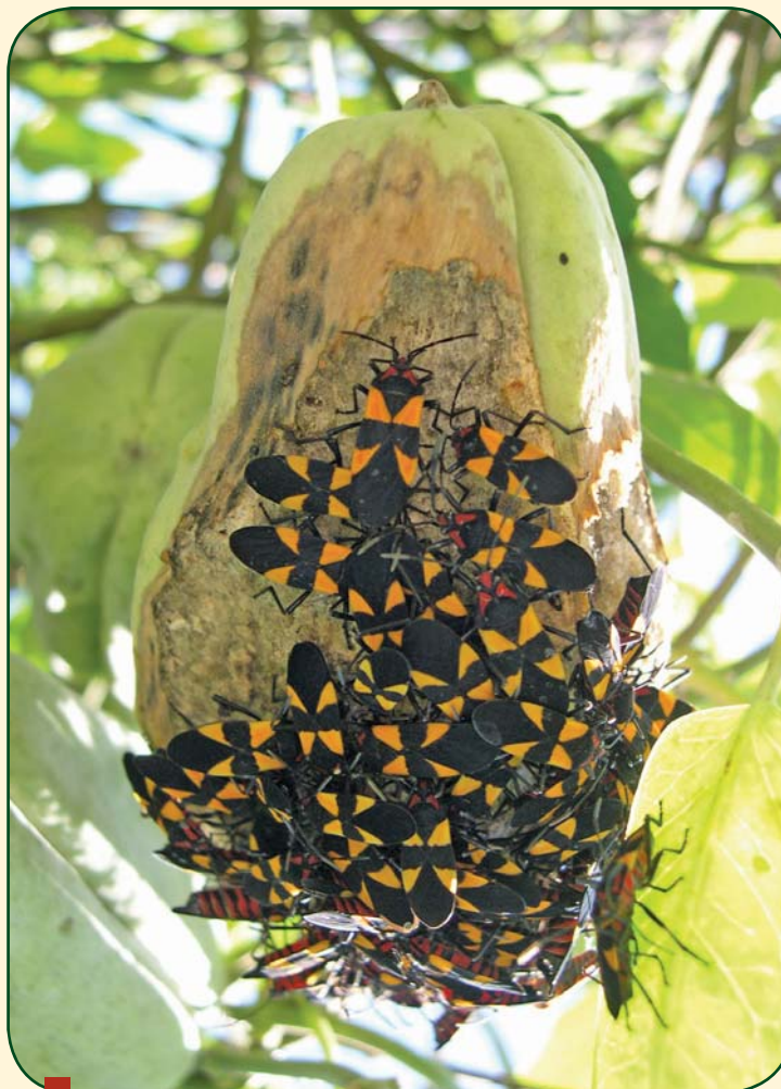
A natural enemy of moth plant, Oncopeltus stali , swarming on a maturing fruit in Argentina.