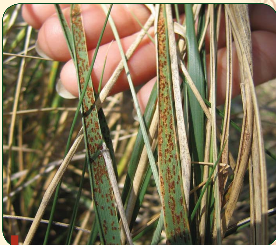
Uromyces pencaus on Chilean needle grass in the field in Argentina.