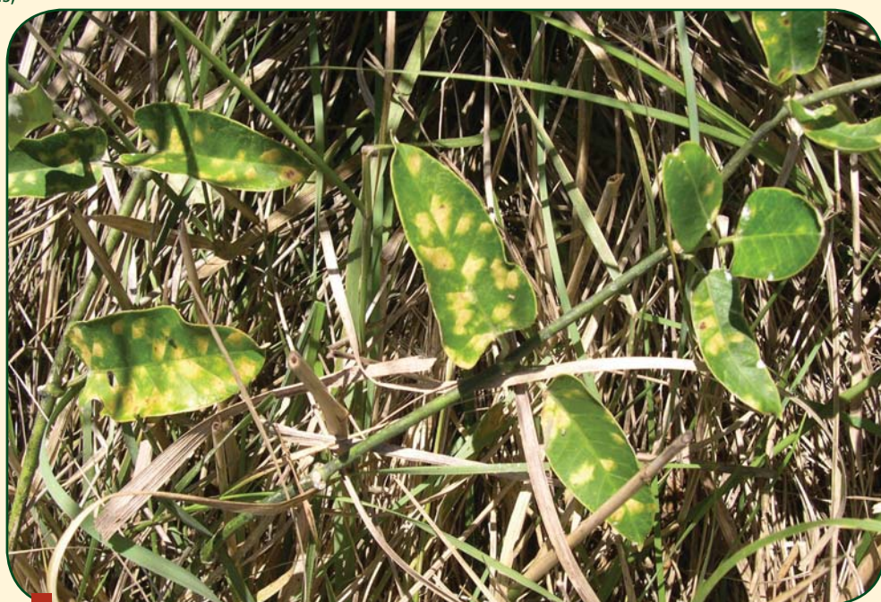
Symptoms of the common fungal leaf pathogen Pseudocercospora .

This project is funded by the national collective of regional councils and the Department of Conservation.