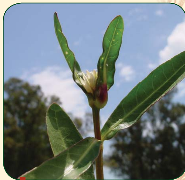
Galled tip caused by the fly Clinodiplosis alternantherae .

"Obviously it would be better to find agents that would not attack these plants than to try to argue that some damage