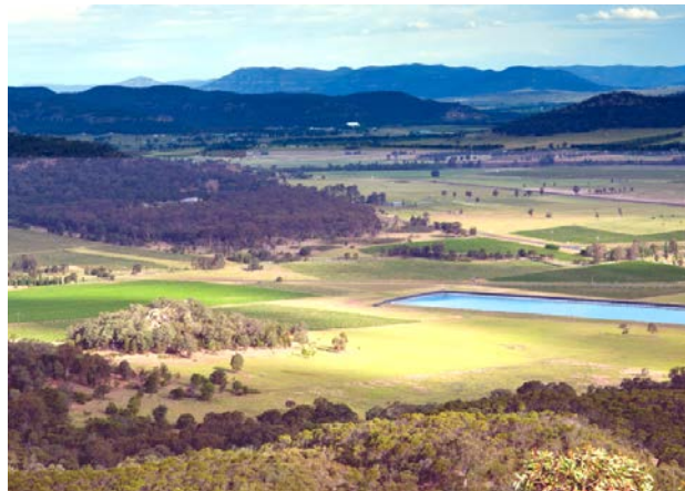
Figure 4: Hunter River Basin, New South Wales, Australia