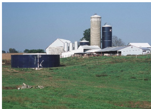
Figure 7: Manure storage, Lancaster, Pennsylvania, USA