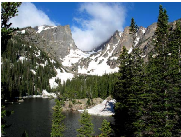
Figure 6: Rocky Mountains, Colorado, USA