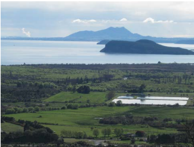
Figure 5: Lake Taupo, New Zealand