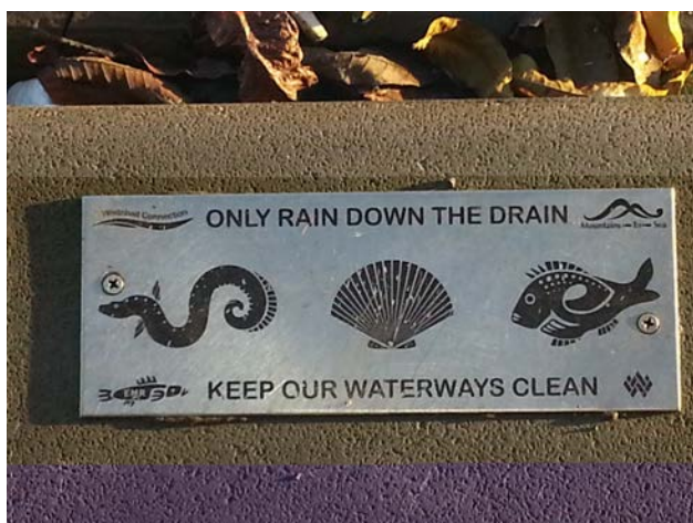
Figure 2: The Drains to Harbour programme symbol on roadways, Whangarei, New Zealand