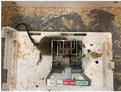
127.5 g male