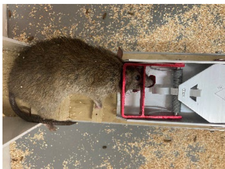
195.3 g male ship rat