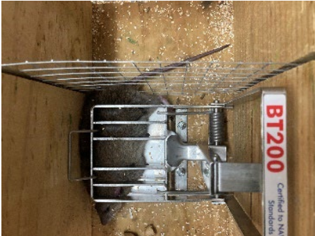
184.3 g female