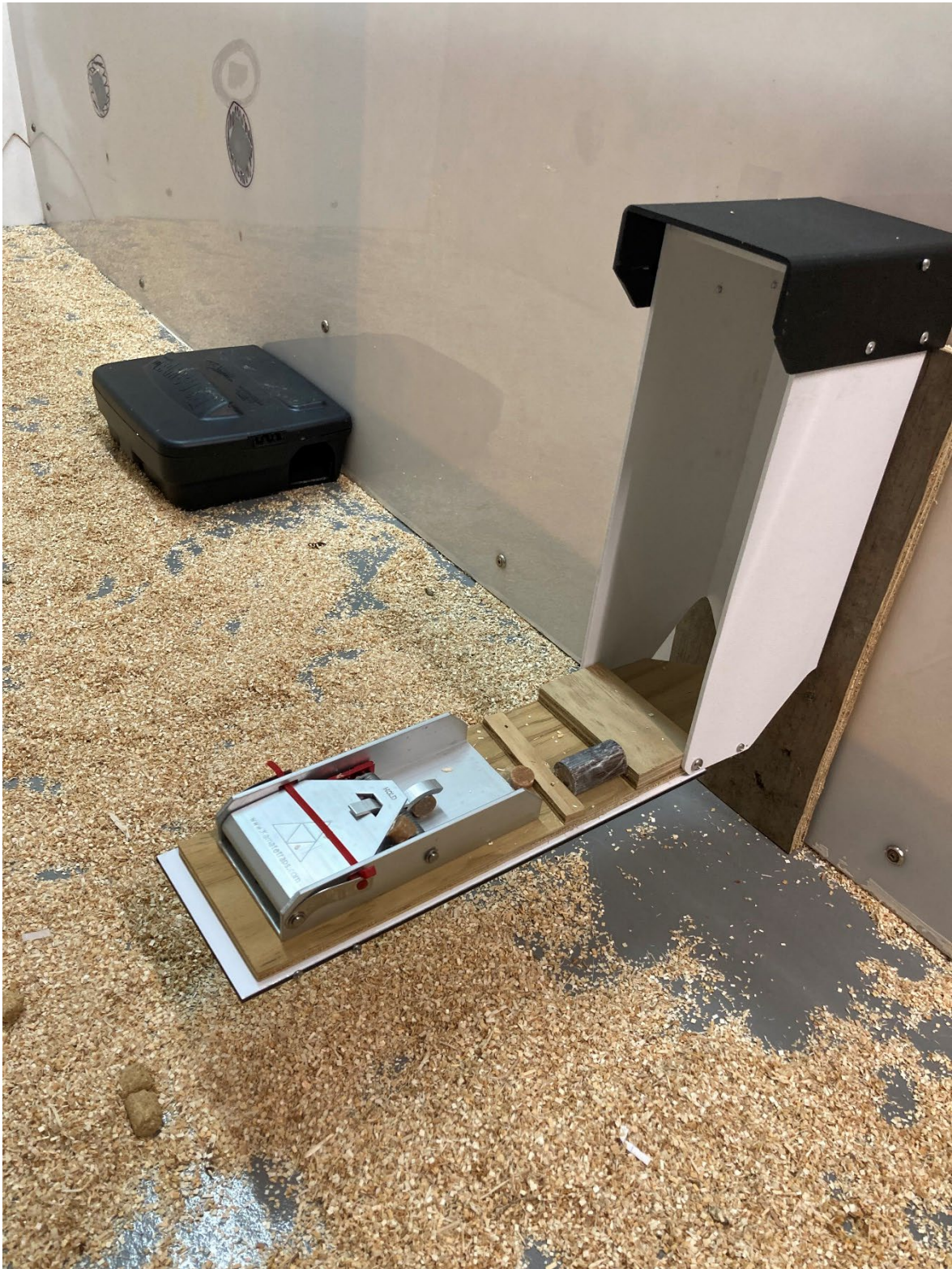
Figure 2. Ka Mate trap and vertically set tunnel (shown open) as deployed for tests 2 & 3. The trap is shown as it was configured for pre-feeding. A cable tie prevented the trap firing and bait was placed under the trap and trigger, and beside the kill-bar cover plate. A cinnamon-lured flax stem was also included as an additional lure beneath the trap. During pre-feeding and testing the hinged tunnel front was closed; rats accessed the trap through the two triangular entry holes at the base of the tunnel. Standard feed pellets are shown in the sawdust to the left of the trap. A Protecta EVO Ambush Bait Station (in background) was provided as a secondary nest box.