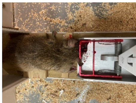
195.3 g male ship rat