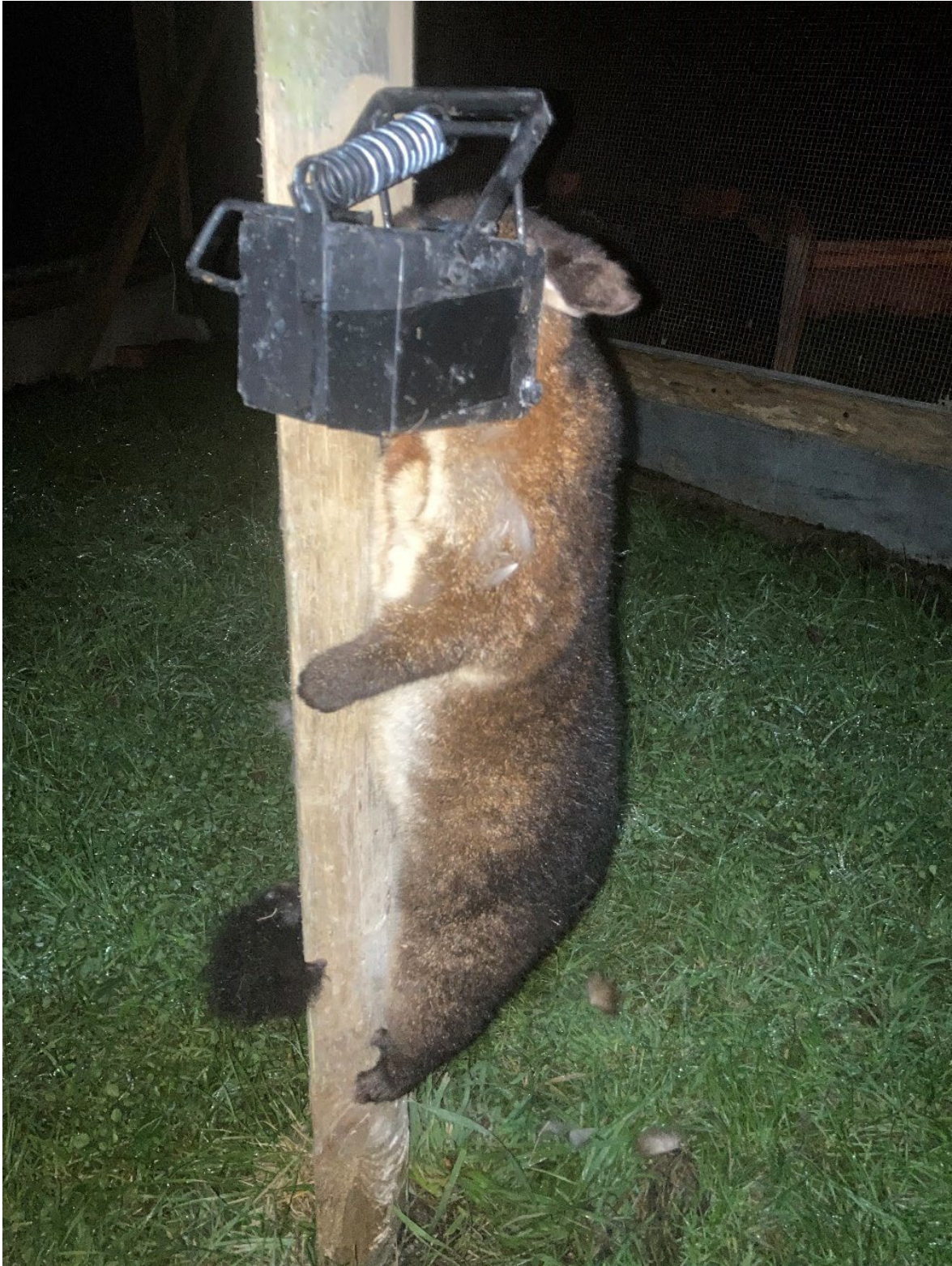
Figure 5. Possum successfully killed in SA3 trap.

premature firing of the trap, either when the possum knocked the external trigger wire with one of its paws, or because its head was angled sub-optimally when it pushed the internal trigger on the post side of the trap.