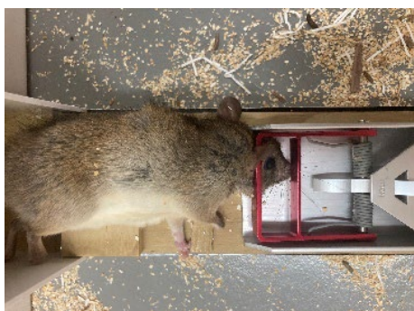
186.1 g male ship rat