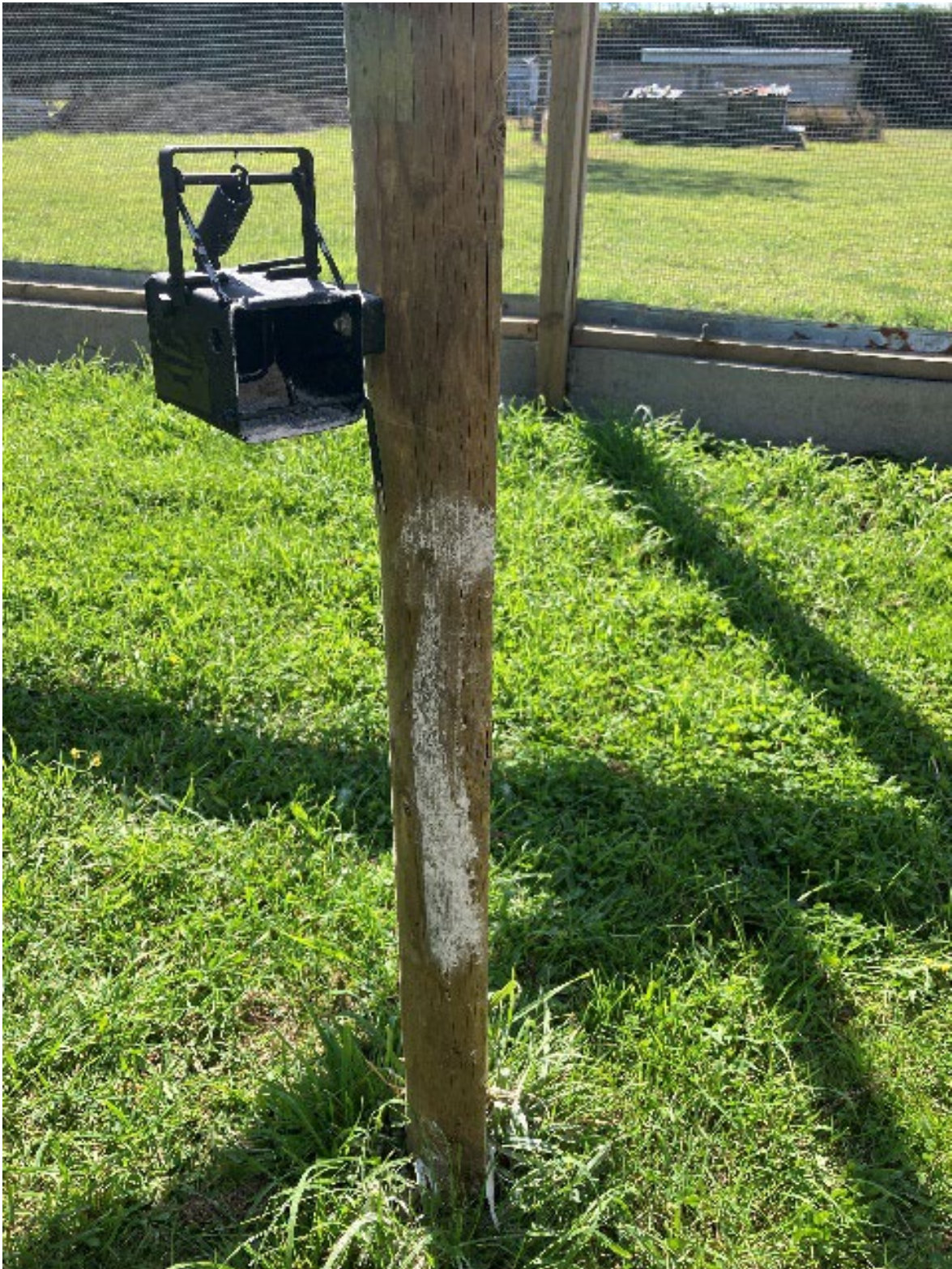
Figure 1. Unset SA3 kill trap attached to a post 75 cm above the ground. The trap was baited with flour lure (50:50 mix of flour and sugar flavoured with five-spice) on the floor of the trap and on the post leading up to the trap.