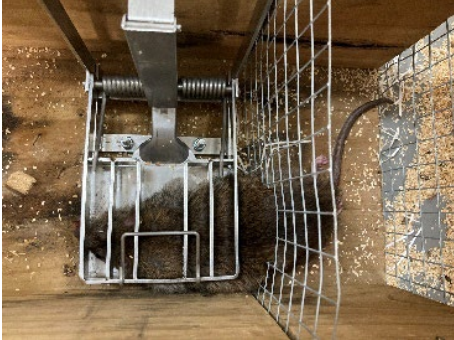
258.1 g male