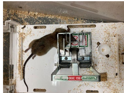
142.0 g male