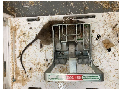
101.7 g female