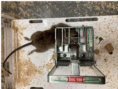
143.4 g male