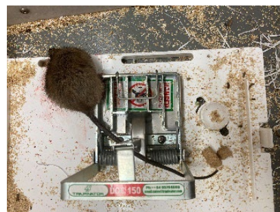
121.7 g female (fail)