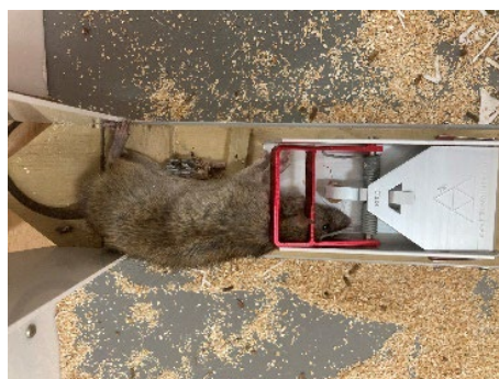
175.5 g male ship rat