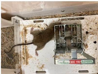
158.5 g male