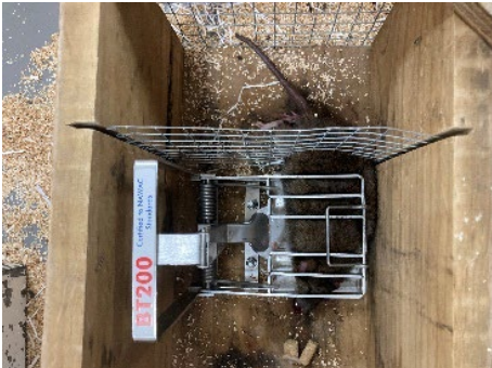
241.0 g male