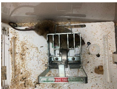
185.8 g male