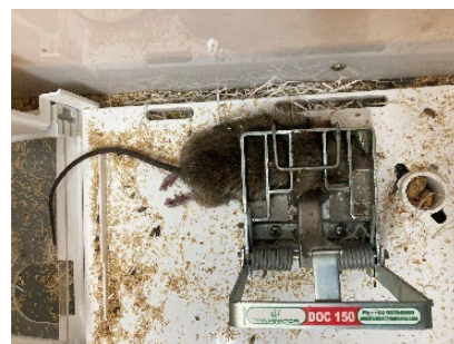
122.0 g female