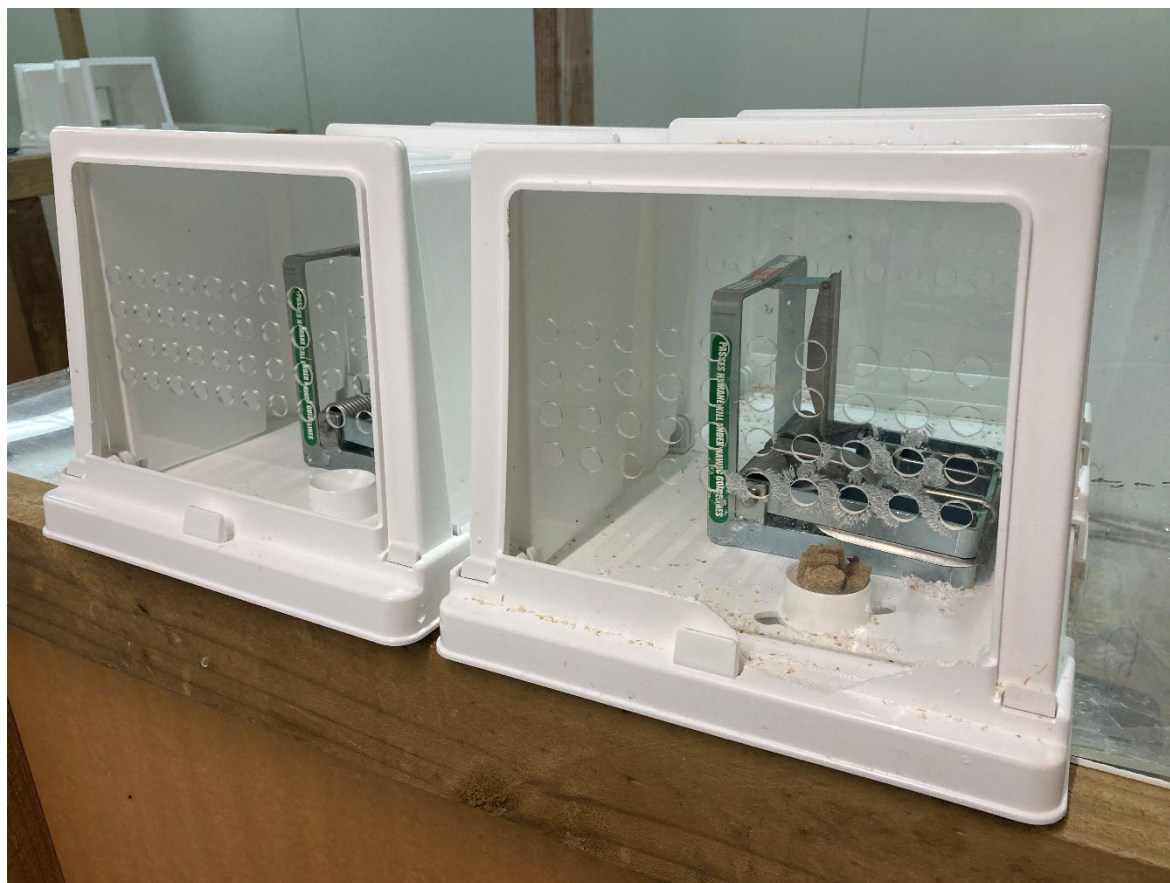
Figure 4. Unset DOC150 traps in CMI plastic tunnels. The tunnel on the right has external damage (chewing) on the lower plastic lip and the rear Perspex baffle caused by a ship rat during the pre-feeding period. Standard rodent feed pellets smeared with either Nutella® or smooth peanut butter were placed in the bait receptacle.

small additional amount of the paste bait was applied on the tunnel floor between the entrance baffles to encourage entry by rats. The rats were pre-fed for 2 to 19 nights with the trap unset before lethal testing commenced. Five rats that did not enter the trap boxes during the pre-feed period were removed from testing and replaced with other rats.