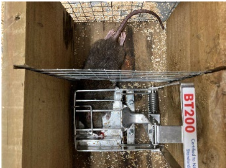
234.5 g female