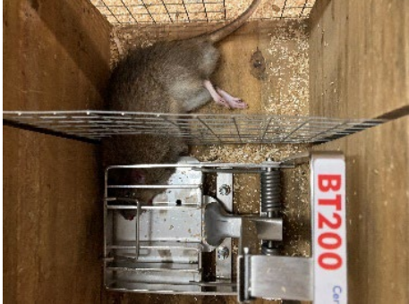
249.7 g male