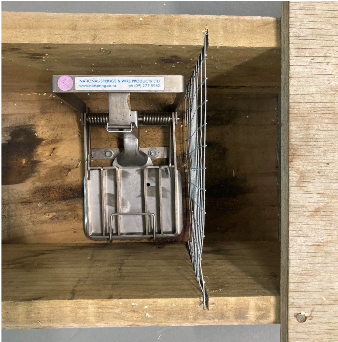
Figure 3. Unset BT200 kill trap in a Haines Pallets single-entrance wooden tunnel. The lid has been unscrewed and opened to view the trap from above. The trap was firmly screwed to the tunnel base. Standard rodent feed pellets smeared with bacon fat were placed to the left of the trap.