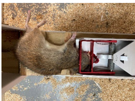
146.0 g female ship rat