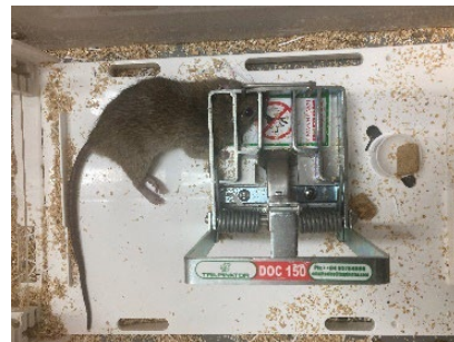
168.5 g male