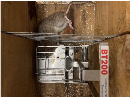
176.1 g male