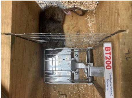
284.5 g male