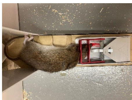
229.7 g female Norway rat