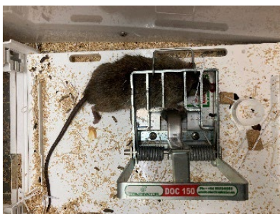
176.8 g male