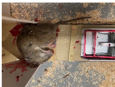
130.2 g female ship rat